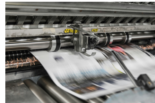
Printing Press

"Finding Wisconsin's Up North! regional guide is published annually putting your name in the hands of thousands of potential patrons."